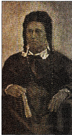
"Little Known Facts of Susanna Dickinson, Messenger of the Alamo" is based on the fascinating life of Texas heroine Susanna Dickinson.

As Messenger of the Alamo, she carried Santa Anna's demand for capitulation to